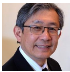
TAB VP Key- note Speaker